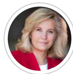
REPUBLICAN Liz Cheney