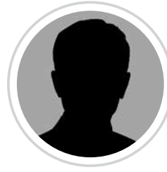
Brett Watson (no photo provided)