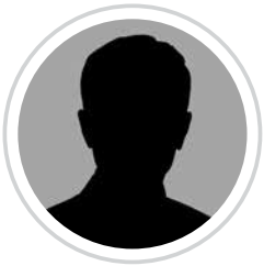
REPUBLICAN Larry Allen (no photo provided)

QUESTION 1: When considering budget deficits, do you support cutting services, raising taxes, or some sort of combination? Please explain.