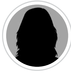
Emily Jarvis (no photo provided)