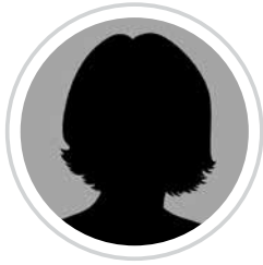
Kathleen Averil (no photo provided)