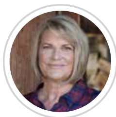
REPUBLICAN Cynthia M. Lummis

QUESTION 1: What is the appropriate balance between state and federal oversight of natural resources and lands in Wyoming? Why?