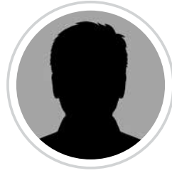
Dan Hahn (no photo provided)

QUESTION 1: What are two attributes and two qualifications that make you ready for this office?