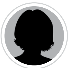
Cherry Plaisted (no photo provided)